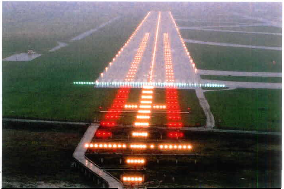
Information on the location of runway thresholds is needed for database entry well in advance of the commissioning date of a new runway

With respect to false warnings, industry sources indicate that over 62 percent of unjustified warnings arise from database errors, while more than 16 percent arise from flight management system (FMS) errors and over 13 percent stem